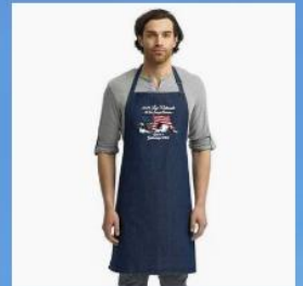
Denim Apron No Pockets $24.00