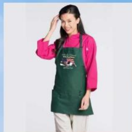
3 Pocket Apron $28.00