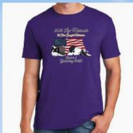
2024 Lop Nationals T Shirt $20.00