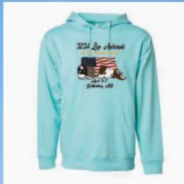
2024 Lop Nationals Pullover Hoodie $35.00