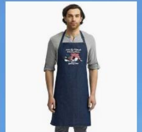
Denim Apron No Pockets $24.00