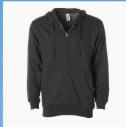
2024 Lop Nationals Zip Up Hoodie $42.00