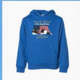
2024 Lop Nationals Youth Pullover Hoodie $35.00