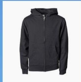
2024 Lop Nationals Zip Up Youth Hoodie $42.00